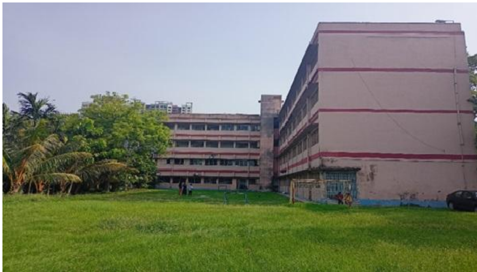
A. Lush green campus

Prasanta Chandra Mahalanobis Mahavidyalaya comprise of a lush green campus with green lawn, landscaping with trees, plants and a beautiful waterbody. Our college premise also has a Medicinal plant garden named Poshan Vatika which has been set up by the department of Food and Nutrition of our college on 27 th September, 2023 with the aim of preserving the valuable medicinal plants in our campus. Ours is an eco friendly green campus which is very environment friendly. Our campus motivates students and staffs to ban the use of Plastic inside the campus- Use of Bicycles as means of transport in highly encouraged both for staffs and students, a bicycle stand is available in the campus for parking is encouraged (bicycle stand). Our college uses separate bins for wet waste, non-biodegradable waste disposal and e-waste disposal. E-waste bin has been installed in our college in the year 2023. Our campus also is a solar panel enabled campus, it has installed solar panels for generating solar power and saving the natural resources. Rain water harvesting is also practiced in our campus, adding another feather to green campus initiative.