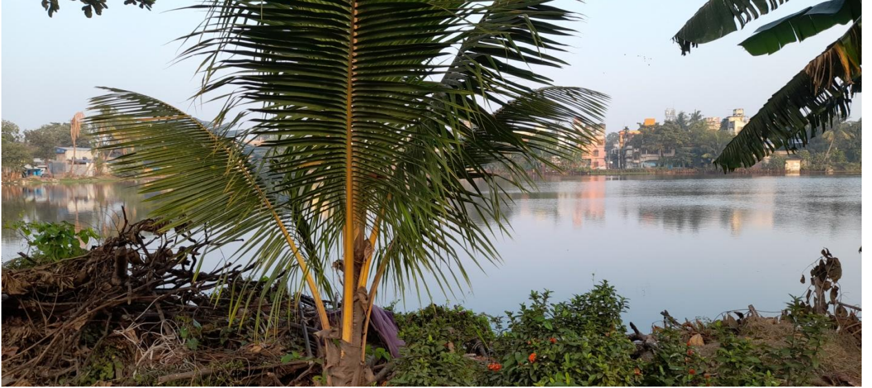
B. Trees and plants beside water body (ADD PIC)