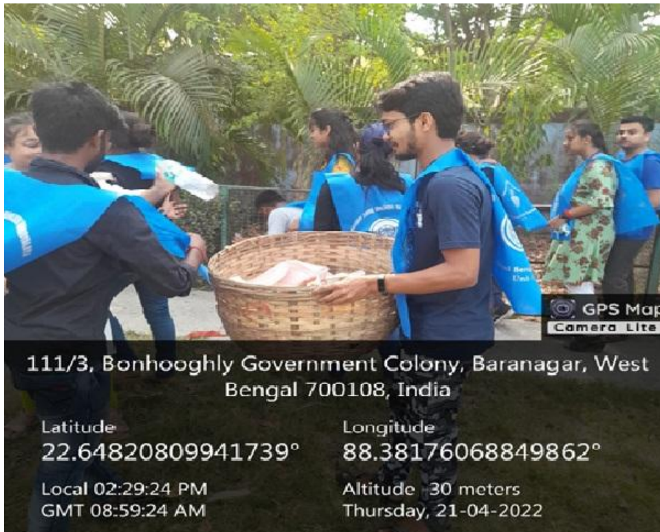
D. Plastic free campus Green campus showing students collecting plastic wastes from campus.