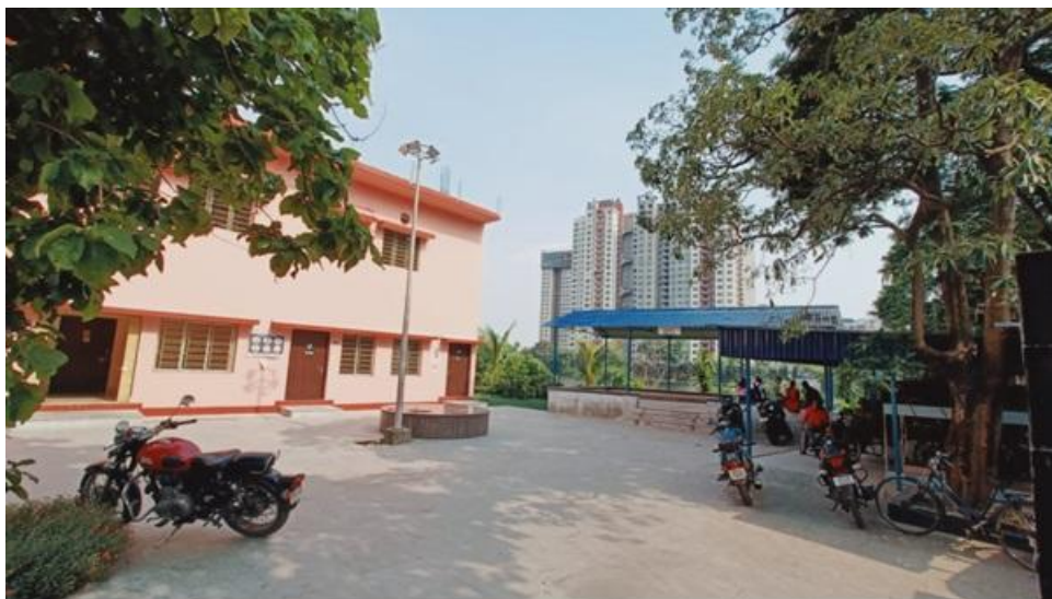
E. Bicycle stand.