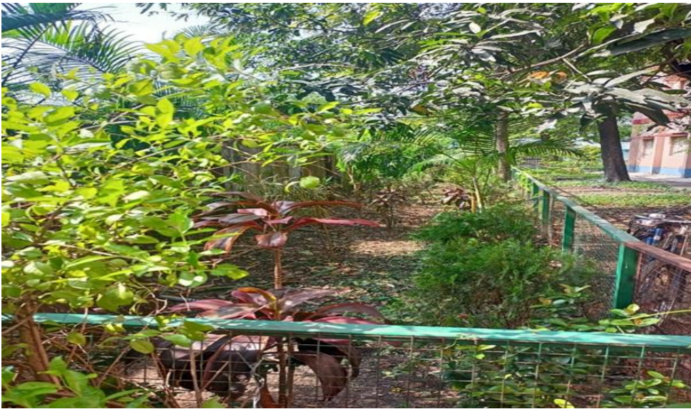
C. Medicinal garden ( Poshan Vatika )